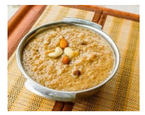
Puffed Rice Kheer

To prepare this exquisite kheer, begin by heating milk in a heavy-bottomed saucepan and allowing it to simmer. Stir the milk frequently to prevent it from sticking to the bottom of the pan. Once the milk reaches a gentle boil, reduce the heat and gradually add sugar to taste. It is essential to allow the mixture to simmer further, as this will enhance the flavor and achieve a rich consistency.