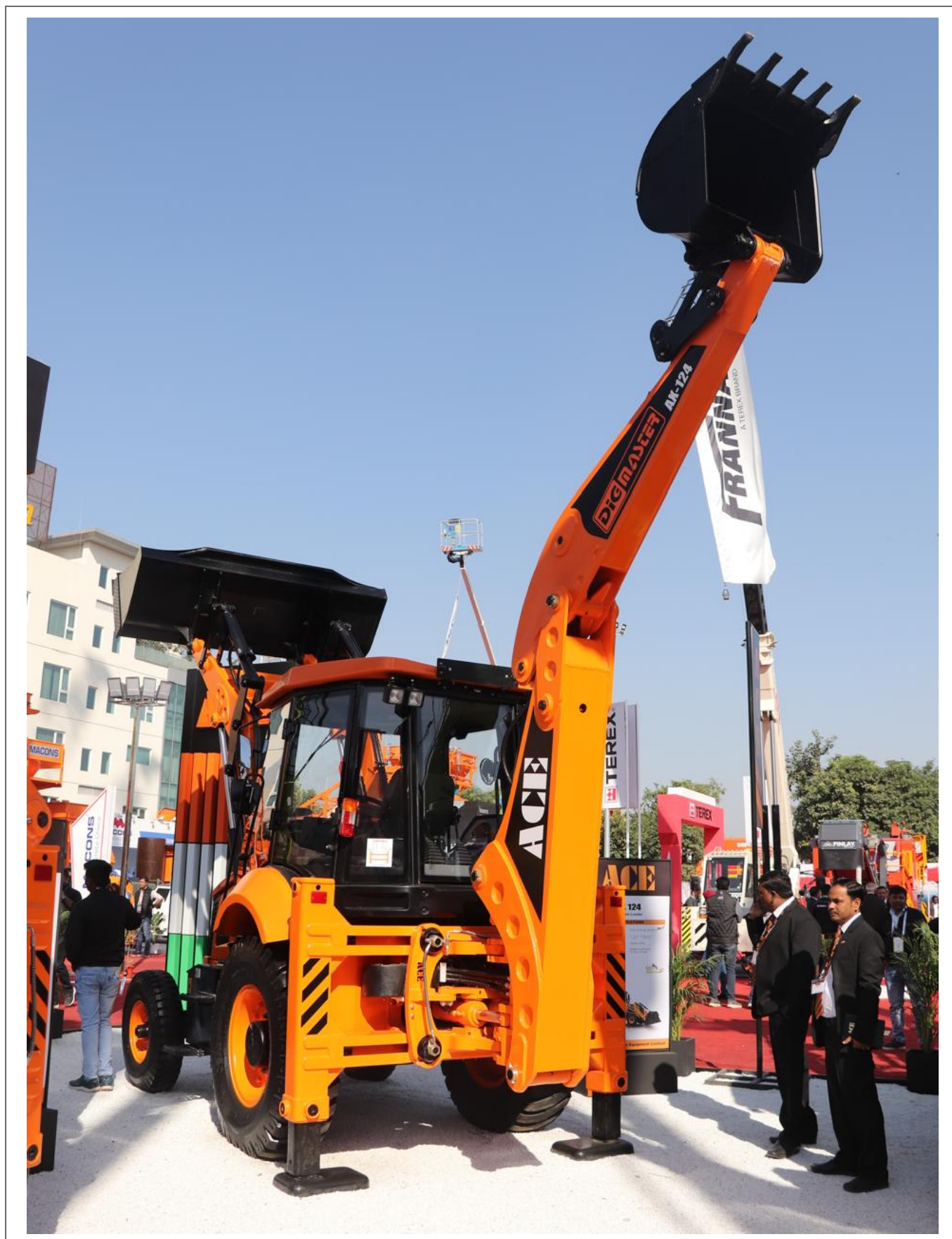
ACE Unveils Next-Gen BS-V(CE-V) Backhoe Loader at Bauma Conexpo 2024