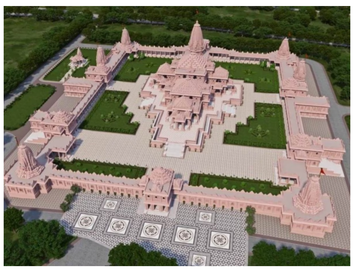
Ayodhya Ram Mandir

sculptures depicting scenes from the life of Lord Ram. The temple complex will also include other facilities such as a museum, a library, and a research center, providing visitors with a holistic experience.