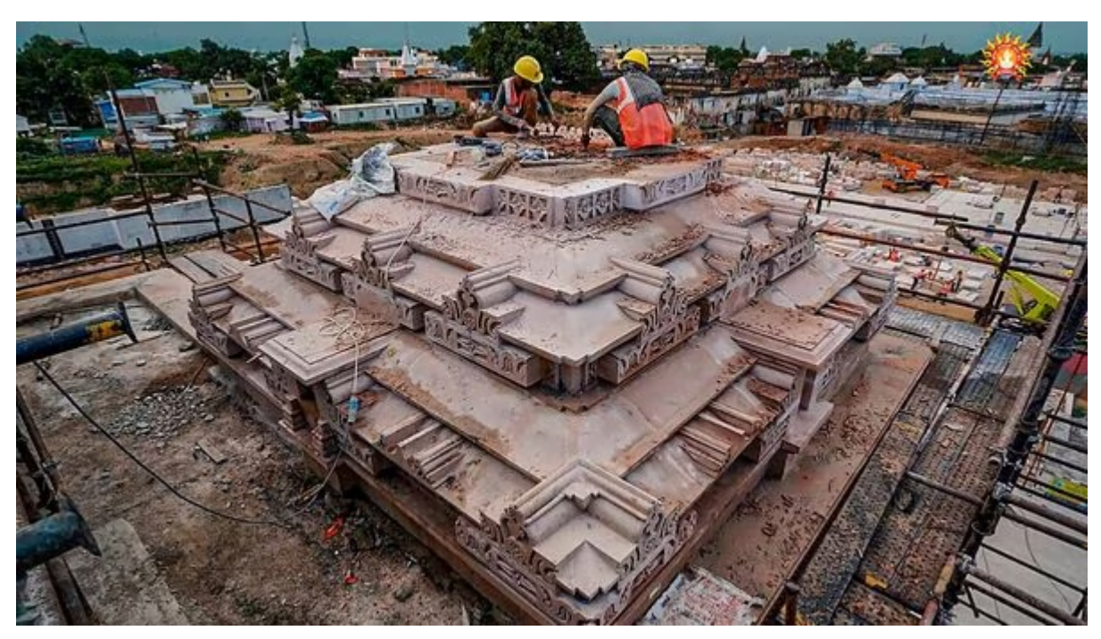
Ayodhya Ram Mandir

Mandir is around 18,000 crores. The funds for the project have been contributed by millions of devotees from all over the world, who have eagerly donated towards the noble cause. The construction of the temple is being carried out by skilled craftsmen and artisans, who are meticulously carving intricate designs and sculptures to adorn the temple.