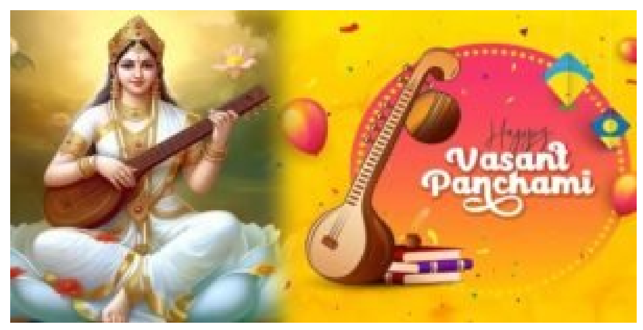
Happy Vasant Panchami 2024

On this day, people traditionally wear yellow attire, as it symbolizes the blossoming of spring and the vibrant energy associated with the <u>festival</u>. Yellow sweets, such as saffron rice or boondi laddoos, are prepared and shared as prasad among family and friends.