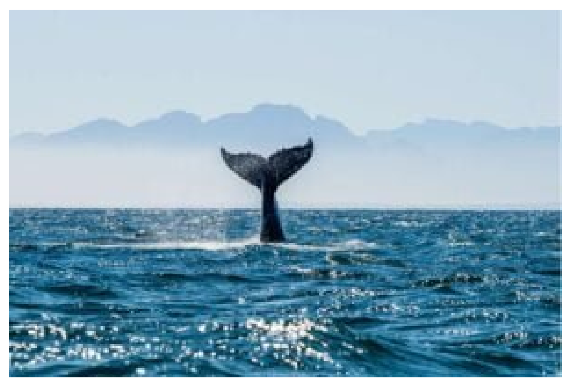
World Whale Day

What started as a local event to <u>raise awareness</u> for humpback whales has now grown into a global movement. World Whale Day aims to promote awareness of the deteriorating <u>health</u> of our oceans and the urgent need for action. It is a call to make the habitats of whales and other marine life safe and sustainable.