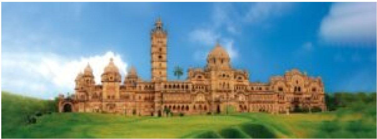
Laxmi Vilas Palace

The Laxmi Vilas Palace, renowned as one of the largest private residences in the world, embodies a harmonious blend of royal traditions and contemporary lifestyle, largely influenced by Radhikaraje Gaekwad's vision. Her stewardship has ensured that while the palace remains a symbol of regal heritage, it also serves as a vibrant part of modern society. This unique juxtaposition has allowed the palace to continue to thrive as both a historical monument and a living cultural space.