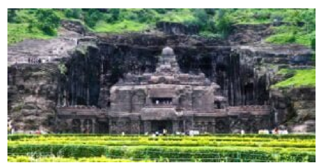
Carving at Ellora Caves

When visiting the Ellora Caves, it is recommended to also explore the nearby Ajanta Caves, another UNESCO World Heritage Site. The Ajanta Caves are renowned for their ancient Buddhist cave paintings and sculptures, offering visitors a deeper insight into the rich history and artistry of ancient India.