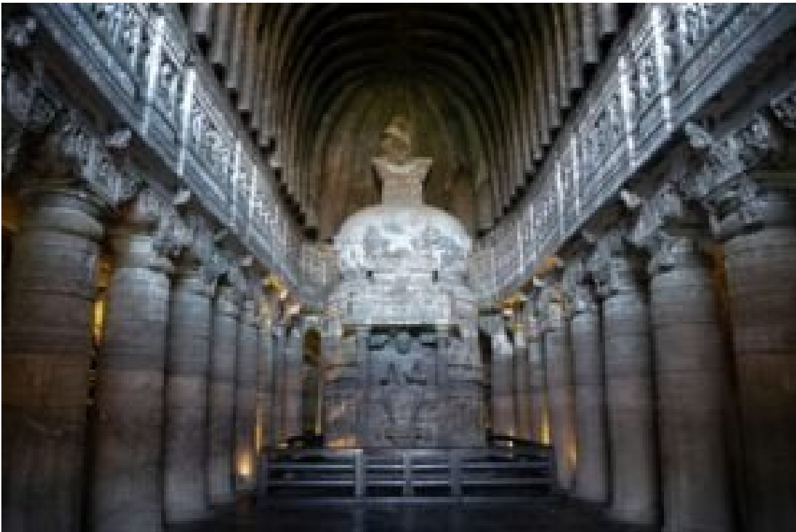
Carving at Ajanta Cave

Together with the Ellora Caves, the Ajanta Caves are one of the major tourist attractions in Maharashtra. Located approximately 59 kilometers (37 miles) from the city of Jalgaon, 104 kilometers (65 miles) from Aurangabad, and 350 kilometers (220 miles) east-northeast of Mumbai, Ajanta is easily accessible to visitors. It is also worth noting that the Ellora Caves, which contain Hindu, Jain, and Buddhist caves, are just 100 kilometers (62 miles) away from Ajanta.