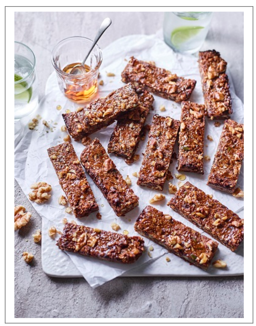
California Walnut Energy Bars

When it comes to <u>baked</u> goods, California walnuts truly take the cake! Whether it's banana bread, chocolate brownies, or walnut cookies, their signature crunch and buttery flavor takes any dessert to the next level. Pair them with chocolate for an unforgettable combination-dip them in melted chocolate and refrigerate them for a quick, luxurious treat. For a healthier option, whip up honey walnut bars to satisfy your sweet tooth while staying mindful of your nutrition.