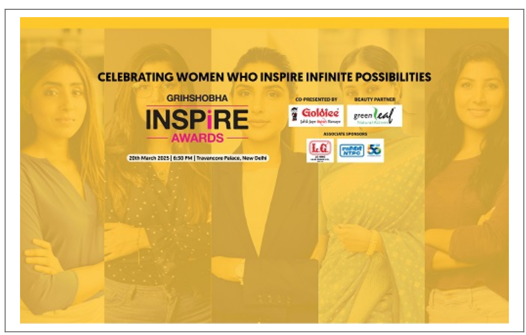
Grihshobha Inspire Awards 2025 - Honoring Women on 20th March!

The Grihshobha Inspire Awards 2025 will bring together eminent personalities, industry leaders, and influencers to recognize and applaud the achievements of women who have broken barriers, shattered stereotypes, and set new benchmarks. These awards reflect Grihshobha's unwavering commitment to empowering women and creating a platform that highlights stories of courage, resilience, and excellence.