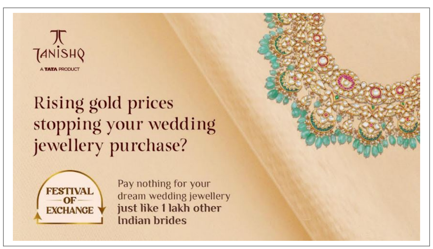
High Gold Prices Holding You Back Tanishqs Latest Gold Exchange Offer Unlocks Maximum Value for its Customers

This initiative is designed for those who see jewellery not just as an ornament but as an evolving expression of their style and milestones. Brides-to-be can now exchange decades of accumulated gold into breath-taking wedding jewellery, crafted with Tanishq's craftsmanship and unique designs. Customers can also exchange their old gold for natural diamonds, elevating their collections with rare and timeless brilliance. With no deductions on 22K and above for pure gold and 21K and above for studded jewellery, customers benefit from a seamless and honest process, reinforced by on-the-spot Karatmeter testing and melting for complete accuracy.