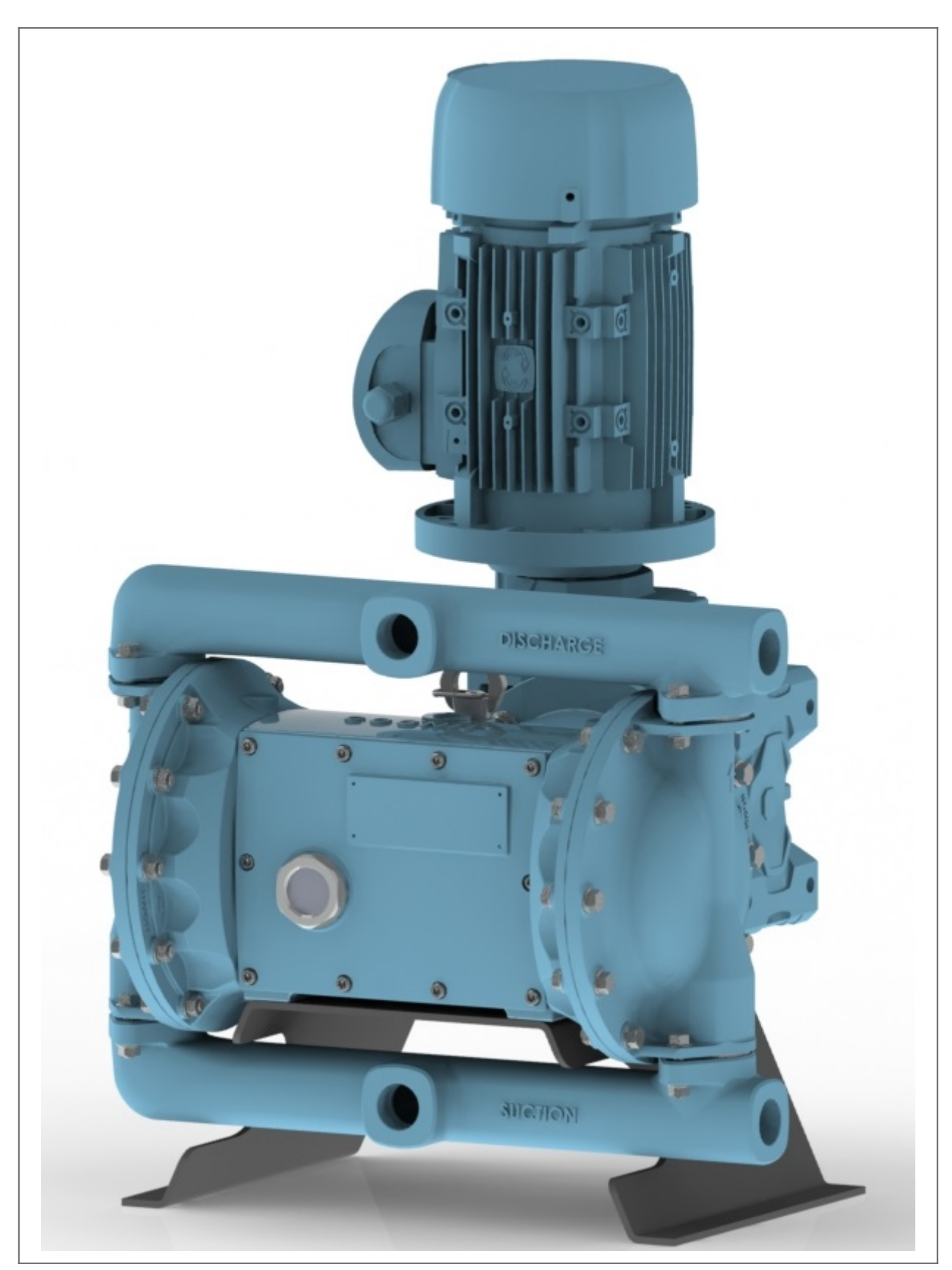
Cognito 1 EODD Pump

transforming industrial fluid pumping solution worldwide with its complete range of heavy-duty EODD pumps, namely Cognito 1 to 4 inches for various flow rates and applications requirement.