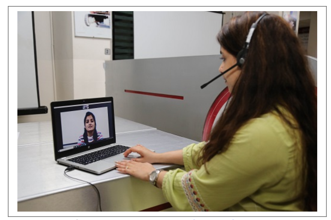
LPU faculty teaching the students via online mode

In addition to equipping <u>students</u> with <u>academic</u> and <u>professional knowledge</u> and skills related to the respective disciplines, LPU Online programs also prepare students to be job-ready through its specially designed Professional Enhancement Program (PEP) and provide various placement opportunities to them in the form of frequent placement and paid internship drives by prominent recruiters.