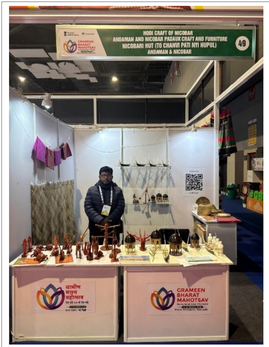
Hodi Craft: Preserving Tradition and Craftsmanship from Nicobar Islands