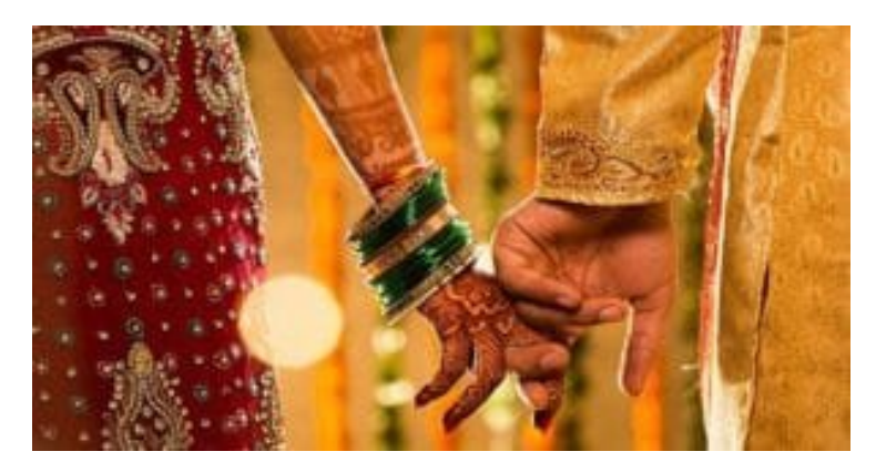
Pre-Matrimonial Investigation Services

When approached for a case involving potential infidelity or matrimonial issues, our team conducts a thorough preliminary assessment. This phase is critical in understanding the client's unique situation and emotional state. At NIS India, we believe that each case is different and should be treated with individualized attention. We encourage clients to share their concerns, as this helps tailor our investigative strategies to meet their specific needs.