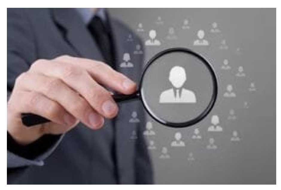
Locate a Missing Person

Locating missing persons is a daunting task that requires not only investigative acumen but also a deeply humane approach. At NIDAAN Intelligence Services (NIS India), we are acutely aware of the emotional turmoil faced by families during such distressing times. Our methodology combines strategic investigation with sensitivity to ensure that we provide support to families while we work to bring their loved ones home.