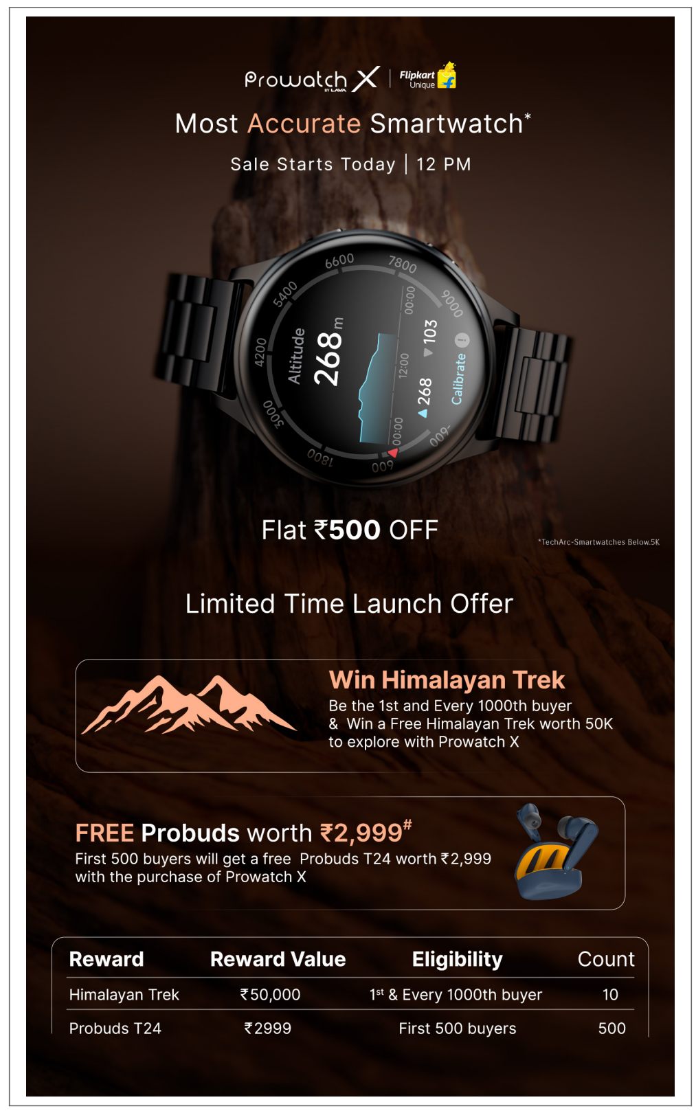
Unmissable Deals on the all new Prowatch X

Prowatch has also <u>introduced exclusive</u> early-bird rewards for buyers. The first buyer and every 1000^{th} buyer will win an all-expenses-paid Himalayan Trek worth Rs. 50,000, offering a chance to experience the breathtaking beauty of the mountains and create unforgettable memories. Additionally, the first 500