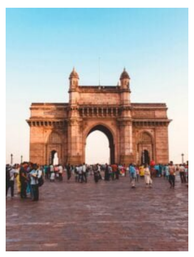
Gateway of India

Visitors can also take a boat ride from the Gateway of India to explore the nearby Elephanta Caves, a UNESCO World Heritage Site known for its ancient rock-cut temples. The monument is surrounded by various other attractions, including the Taj Mahal Palace Hotel, which adds to its allure.