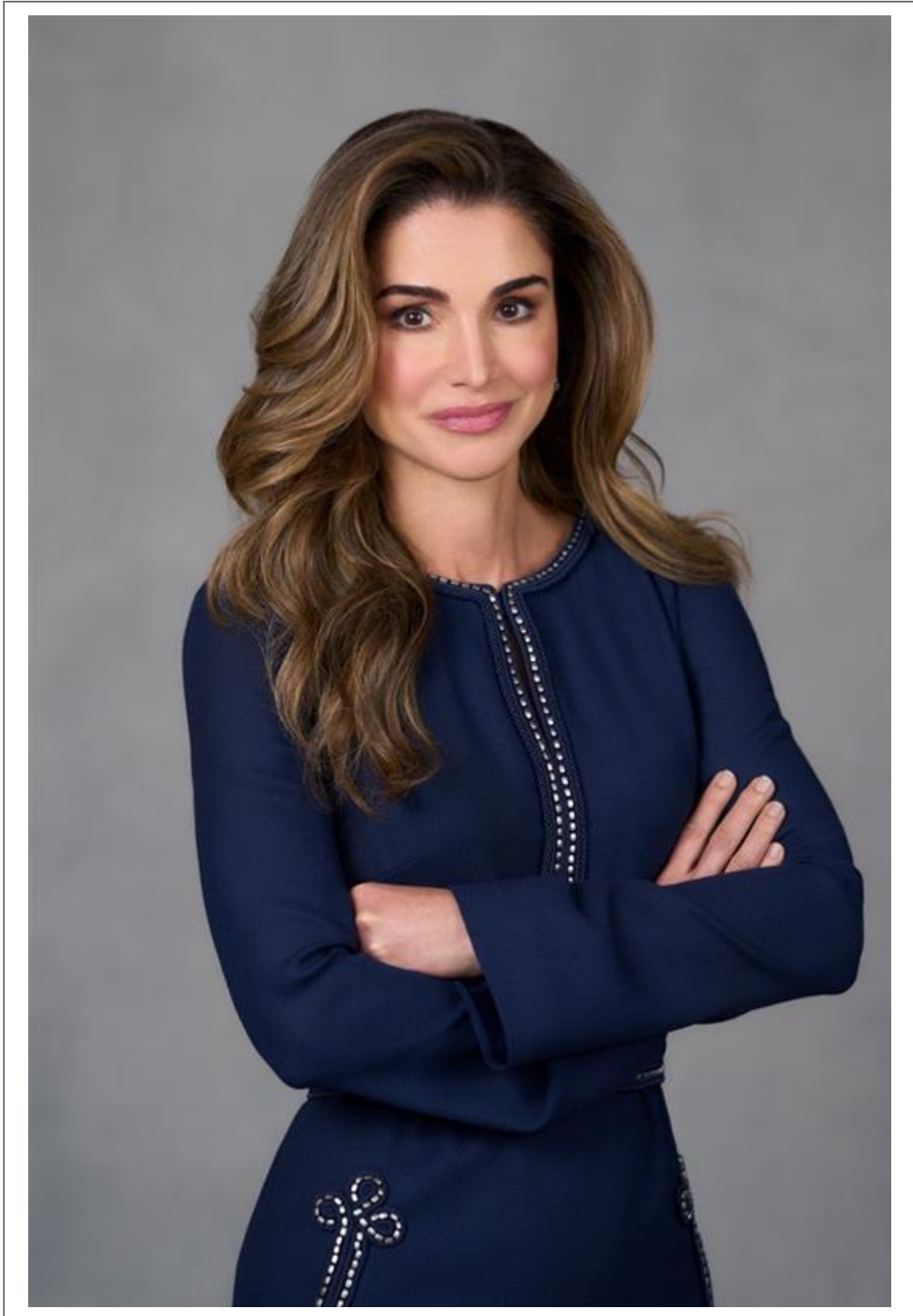
Her Majesty Queen Rania Al Abdullah

shifts reshaping the global economic and industrial landscape.