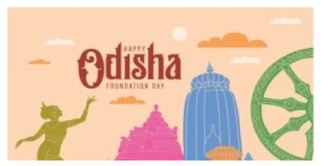
Happy Odisha Foundation Day 2024

Utkal Divas is not just a day of celebration; it is also an opportunity to showcase the rich cultural heritage of Odisha. The state is known for its diverse art forms, dance styles, music, literature, and handicrafts. From the intricate stone carvings of the temples at Konark and Puri to the graceful movements of Odissi dance, Odisha's cultural heritage is a treasure trove of artistic excellence.